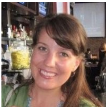
Principal Product Marketing Manager at Turnitin